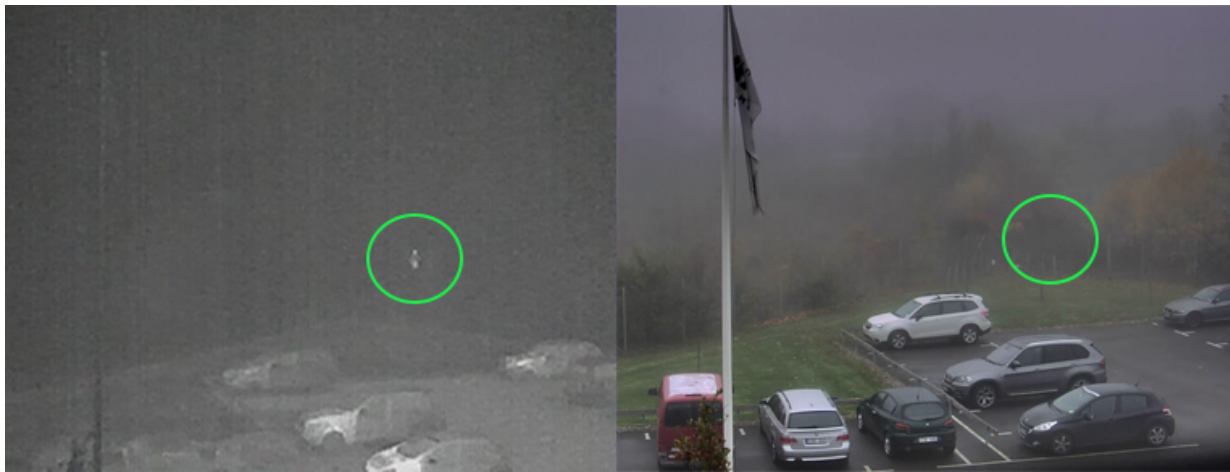
Images taken with a thermal camera (left) and a visual camera (right) on a foggy day. An individual (circled for reference) can be distinguished with the thermal camera but not with the visual camera.

Axis thermal cameras work primarily in the long-wavelength infrared (LWIR) wavelength range. In general, the transmission of LWIR wavelengths is considerably better in conditions with airborne particles, such as fog and smoke, compared to visible wavelengths. In most cases, the 'short' visible wavelengths are absorbed and scattered by the particles to a higher degree than the LWIR wavelengths are. This decreases the detection range of the visual cameras compared to the thermal ones. A person that is clearly visible with a thermal camera in foggy weather might be invisible to a visual camera.