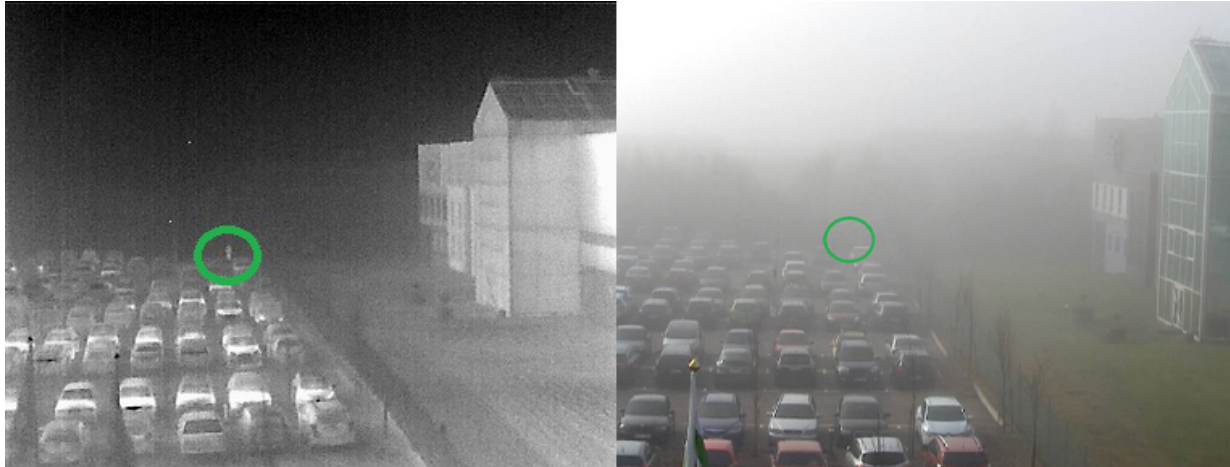
Image from a thermal camera (left) and a visual camera (right) on a misty day. A person (circled) can be distinguished with the thermal camera but not with the visual camera.

It is essential to remember that Johnson's criteria are valid only in ideal conditions. The weather conditions on site will affect the detection range of both the human eye, a visual camera, and a thermal camera. The detection range of a thermal camera is usually less influenced by the weather, for example on a misty day, than the range of a visual camera.