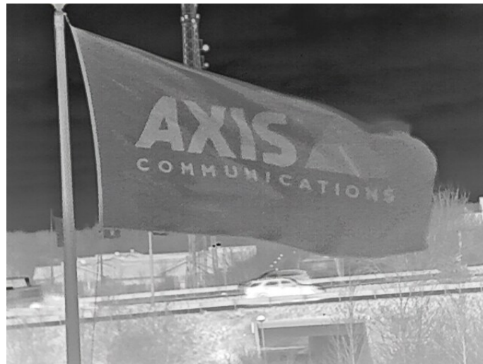
Flag disturbing the view.

Thermal cameras with support for electronic image stabilization are less affected by vibration. However, these factors should still be considered when installing a thermal camera, to optimize camera performance.