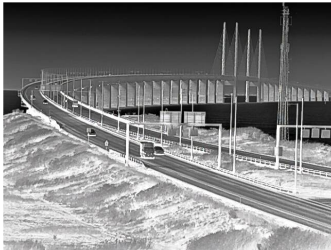
Sharp contrast in the background on a sunny day.

On a cloudy day, the contrast in the background will be lower in the same way, whereas on a sunny day it will increase. Temperature differences increase because things with different surface material will be heated at different rates.