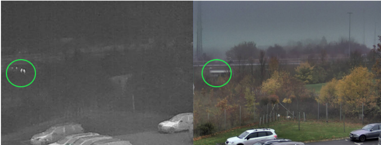
Images taken with a thermal camera (left) and a visual camera (right) on a rainy day. The individuals (circled for reference) are easily distinguished with the thermal camera.

easier for a thermal camera to detect a person, since the contrast between the warm person and the cold background will be higher.