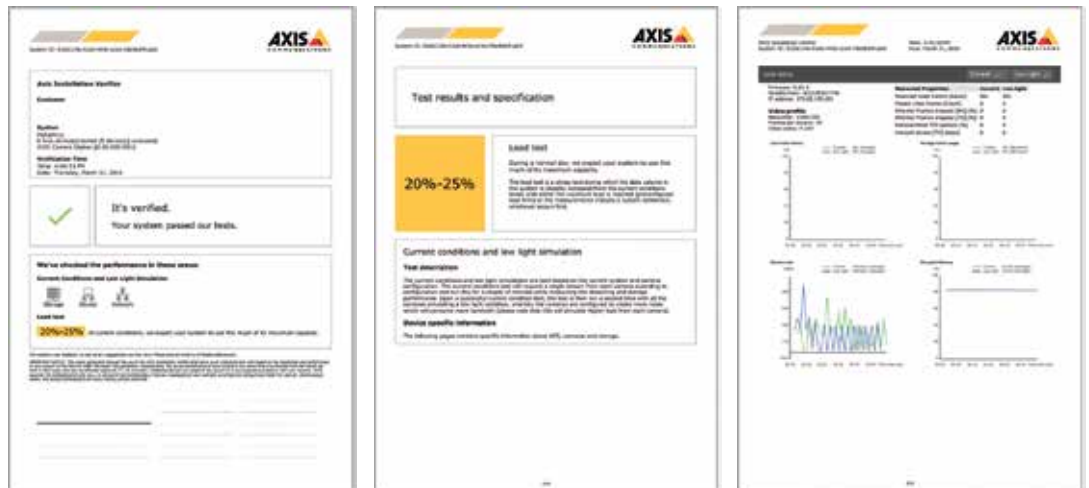
AXIS Installation Verifier provides valuable information about system performance in normal operation, low-light conditions as well as how your system will behave in more extreme situations.

A successful test will verify that the system is ready, and that it has the right configuration to handle day-to-day operation.