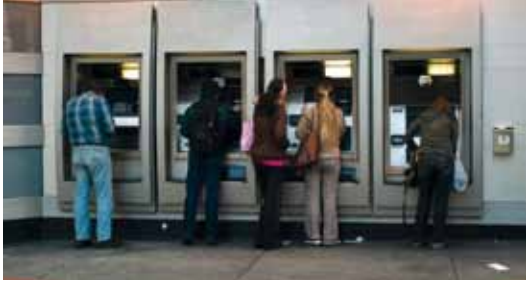
With Axis, you benefit from the world's leading range of network cameras, including ATM monitoring solutions for both indoor and outdoor use.