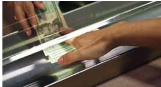
Axis solutions enable you to create a future-proof, flexible and cost-efficient surveillance system.

Video analytics also provides in-depth reports, charts, and graphs to help your organization make better decisions. You can use the information to optimize the network video security system as well as increase efficiency in terms of staffing requirements, customer satisfaction, employee training, and more.