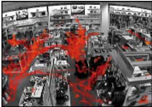
Image from a network video system that registers and visualizes aisle traffic. The red tracks represent customers.