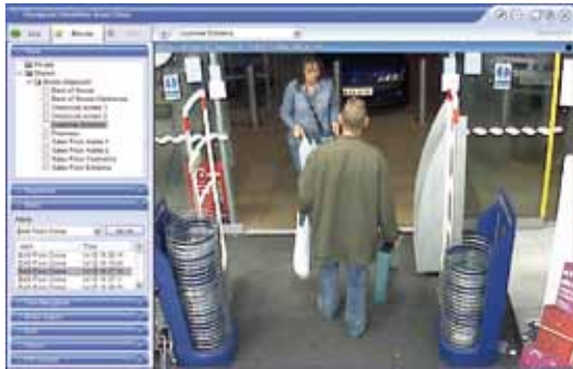
When integrating network video with the EAS system, high-quality video of EAS events is only a mouse-click away.