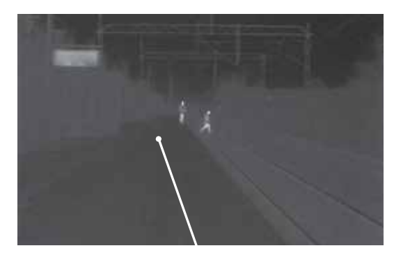
Example of a virtual fence.

Once the intruder is found the operator can zoom in on and get the details thereby being able to verify whether there is a threat or not. State-of-the-art network cameras deliver sharp images with very high resolution.