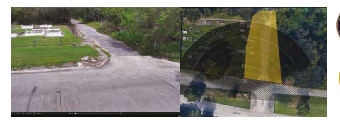
When the Axis network radar detector senses an event, it redirects the PTZ camera from its default position to track and record culprits illegally dumping.