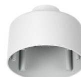
PC30VE-VB Pendant Mounting Kit