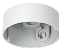
CB30VE-VB Conduit Box