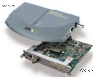
AXIS 570 MIO Print Server