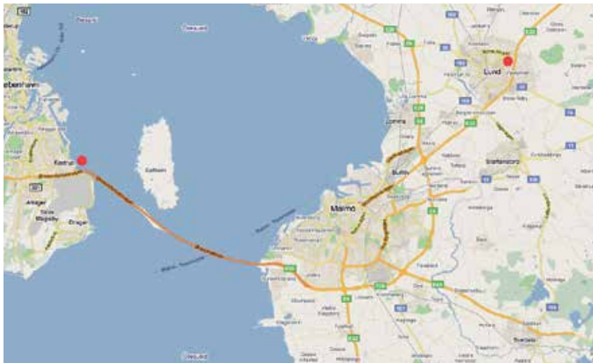
Map showing Lund in southern Sweden and location of Copenhagen airport (Københavns Lufthavn - Kastrup) and Malmö/Sturup Airport. The Axis office is located directly next to the E22 motorway, on the northern side of Lund.

Regulations in Sweden allow customers to choose any taxi, not necessarily the first car in the line. If questioned by other drivers, just state that you have a contract with the company you select.