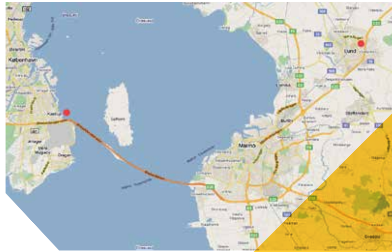
Map showing Lund in southern Sweden and location of Copenhagen airport (Københavns Lufthavn – Kastrup) and Malmö/Sturup Airport. The Axis office is located directly next to the E22 motorway, on the northern side of Lund.

Regulations in Sweden allow customers to choose any taxi, not necessarily the first car in the line. If questioned by other drivers, just state that you have a contract with the company you select.