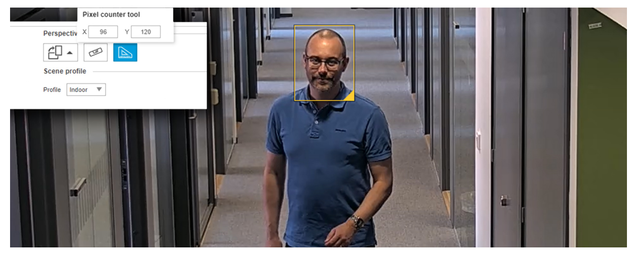
Figure 4. A camera view with the pixel counter visible. The tool shows that we have 96 pixels across the frame, which means that identification is possible (requiring at least 40 pixels across the face).

can be displayed in the camera live view with a corresponding counter to show the width and height, in pixels, of the frame. It can be adjusted and moved around in the image through drag-and-drop.