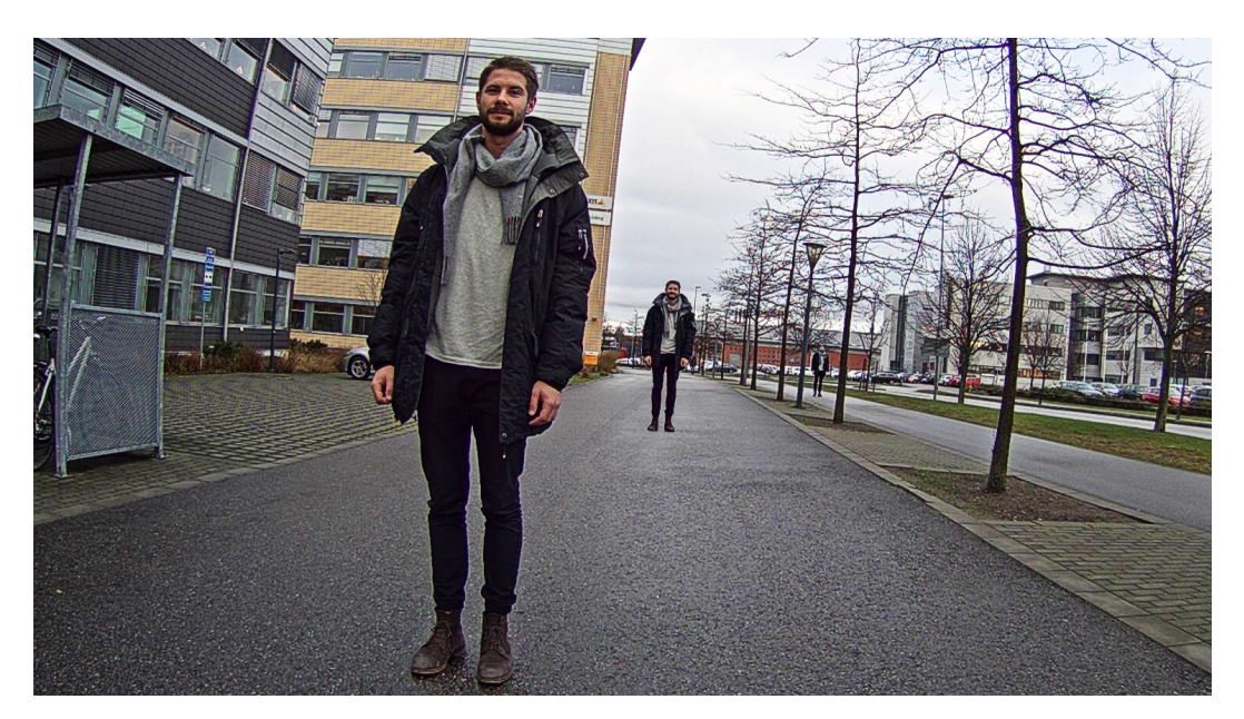
Figure 1. A combination of three photos of the same individual in order to represent three of the operational requirement criteria. The person closest to the camera is close enough for identification. The person in the middle can be recognized, while the person farthest away can only be detected.

would apply. Thermal imaging (using thermal cameras) also uses a different set of specifications for operational requirements.