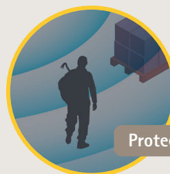
Protection inside the perimeter

Track threats that have breached the perimeter, and guard assets against theft and sabotage. Effectively surveil wide areas, even in complete darkness, and detect and deter unwelcome activity near key assets.