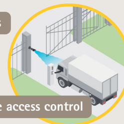
Vehicle access control