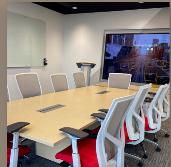
John A. Roebling Bridge Room 10– person conference room