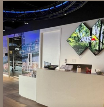
Entrance Over 60,000 possible solution combinations