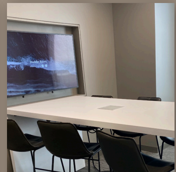
Huddle room 6– person conference room