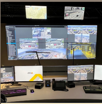
SOC State-of-the-art Security Operations Center (SOC) complete with the ability to view live cameras and test Axis solutions