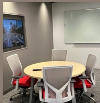
Fountain Square room 4– person conference room