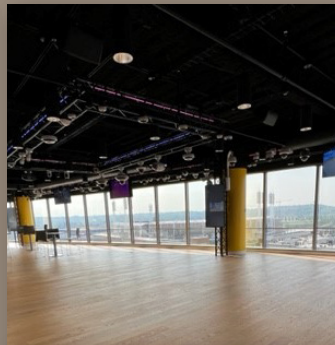
Community Room Large community room overlooking downtown Cincinnati with the ability to host events with 75+ people