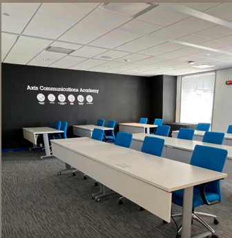
Academy Room 18– person training and certification room