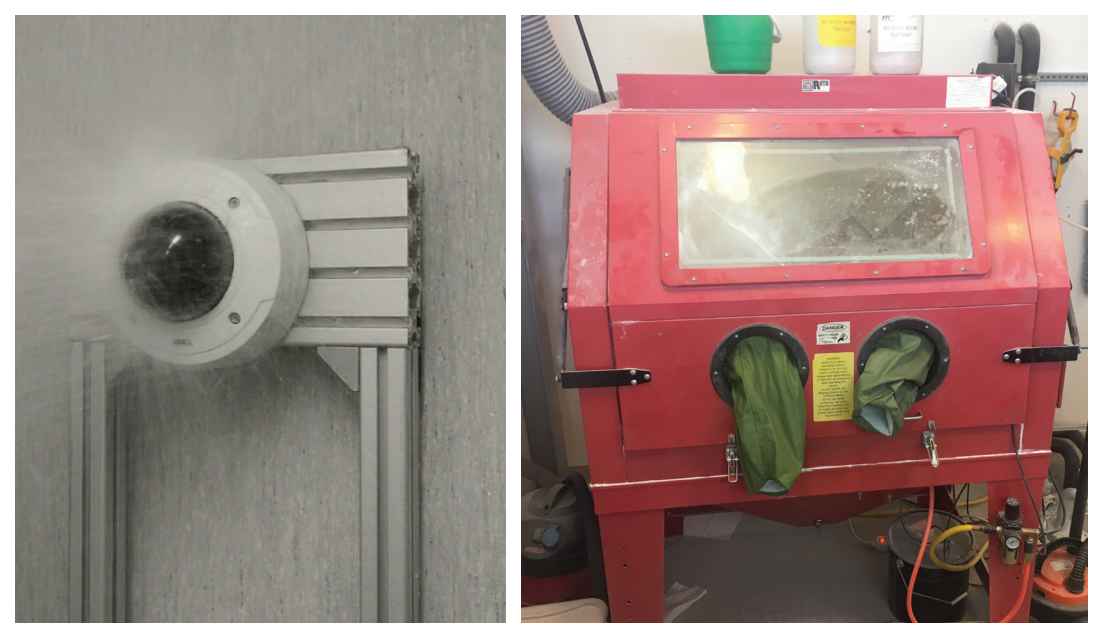
Figure 3: Left: Water-proof test of a camera, right: Dust lab.

During the next test, the camera is exposed to a high pressure water stream with a flow rate of 100 l/ minute (26 gallons/minute) onto the camera from 2.5-3 m (8ft 2 in-9ft 10in) away. Following the test, the camera is opened and inspected for water ingress with special attention paid to its sealing gaskets. Its functionality is also thoroughly checked.