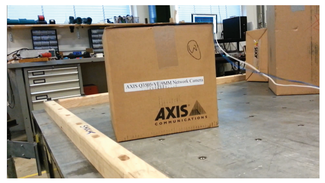
Figure 4: Equipment used for the shipment test.

Shipment tests are run on packages to determine the integrity of the packaging and its ability to protect the product. A camera, in its packaging, is placed on a platform. It is then subjected to a random vibration profile that replicates a bouncing truck on a poor-quality road. A typical test simulates thousands of miles travelled by road and air.