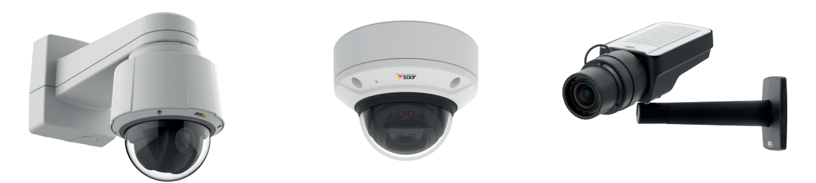
Figure 1: Various types of Axis network cameras.

This document summarizes how the quality of Axis products is ensured by way of thorough and exhaustive testing.