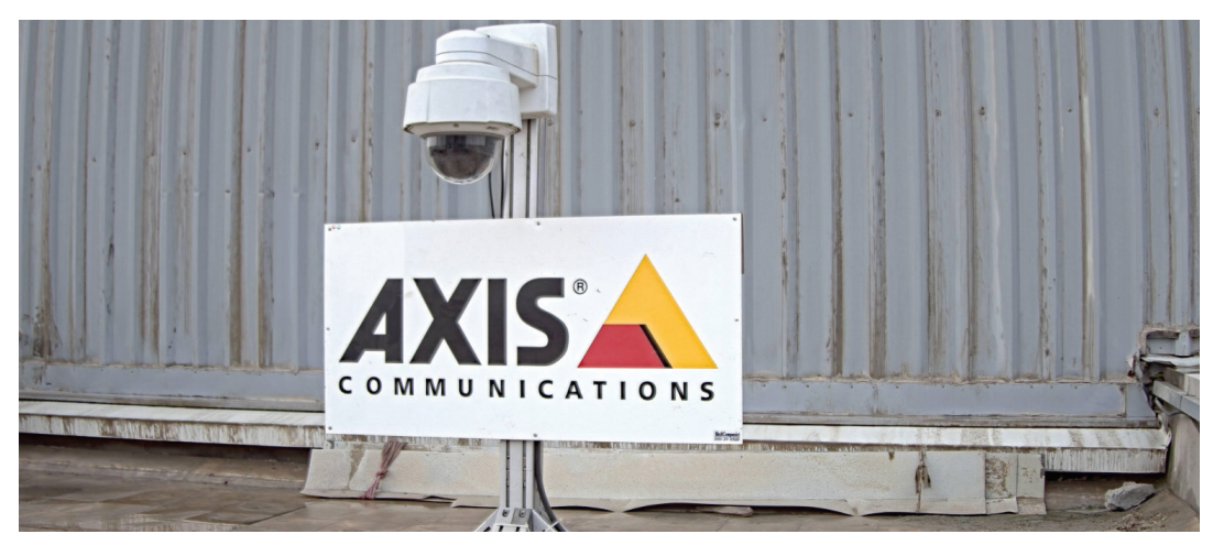
Figure 7: Axis test camera installed on site in Dubai.