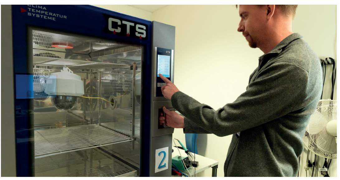
Figure 5: Temperature test in a climate chamber.

Temperature tests in labs are performed in climate chambers, where all types of temperatures and climates can be simulated. Tests are made with an interval margin of \pm 15 °C ( \pm 27 °F) at either end of the operational temperature range. The humidity range spans from 0 to 100%.