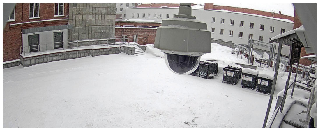
Figure 6: Axis test camera installed on site in Novosibirsk.