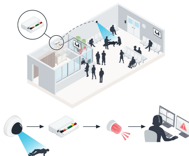
Alarm system integration

Find out more at axis.com/products/axis-a9210