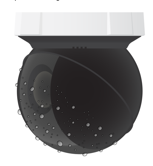
Without hydrophilic coating