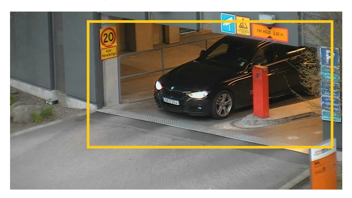
Figure 3. A focus recall area at a parking garage exit.

license plate of cars leaving the garage. The box in figure 3 symbolizes the area where the user has set a focus recall area. As soon as the user pans or tilts the camera view into the focus recall area, the camera will focus on the license plate.