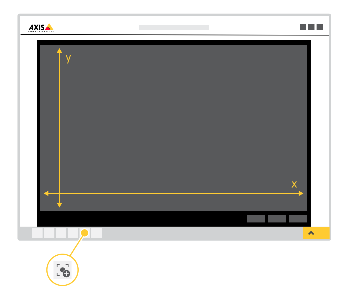
Figure 1. The camera GUI with focus recall button. X is the pan range, Y is the tilt range.

The focus recall feature is very easy to use. The user sets a focus recall area by clicking the focus recall button when the view has the desired focus. The focus recall button is placed in the live view control bar of the graphical user interface (GUI) of the camera. See figure 1 .