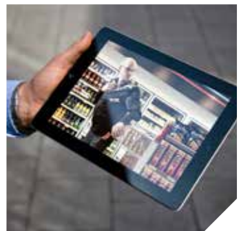
Flexible Internet access to the video service portal via PC, laptop or mobile phone.