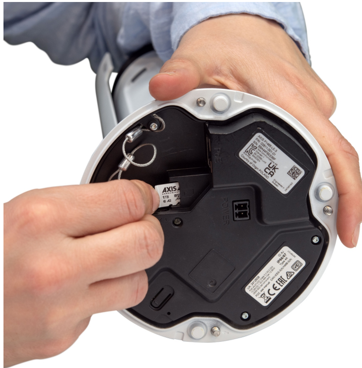
Figure 1. A surveillance card in an Axis camera.

Axis surveillance cards are high endurance microSDXC™ cards that are specially developed to match the typical memory-writing behavior of a surveillance camera. They can be written and overwritten many more times than consumer-grade SD cards can. Thus, the same card can remain in the camera for a longer time without wearing out. Axis surveillance cards come with a 5-year warranty, but versions with 256 GB storage and higher have shown to generally last even beyond 10 years or for as long as you typically use the camera.