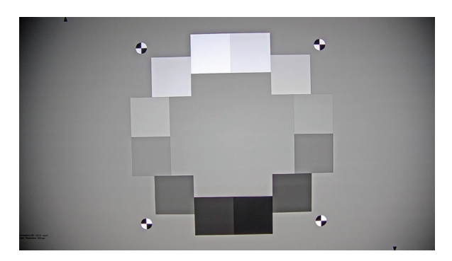
Figure 1: Axis gray card exposed at default settings.

1. Use a gray card with a reflectance value of approx. 30%, see Figure 1.