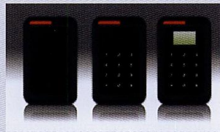
AMR100 contactless smartcard readers

The Institute for International Research (IIR) hosted the African National Security Conference here, included national and political security issues, which were buzz words among delegates. A number of workshops and talks were arranged by the SA Security Association (SASA) over the three Securex days. 35