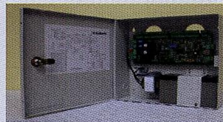
ACU205 two door