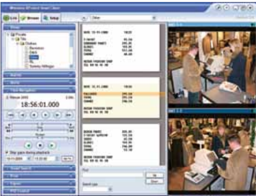
Analyzing exception receipts with high-quality video dramatically reduces time needed to investigate suspect transactions.