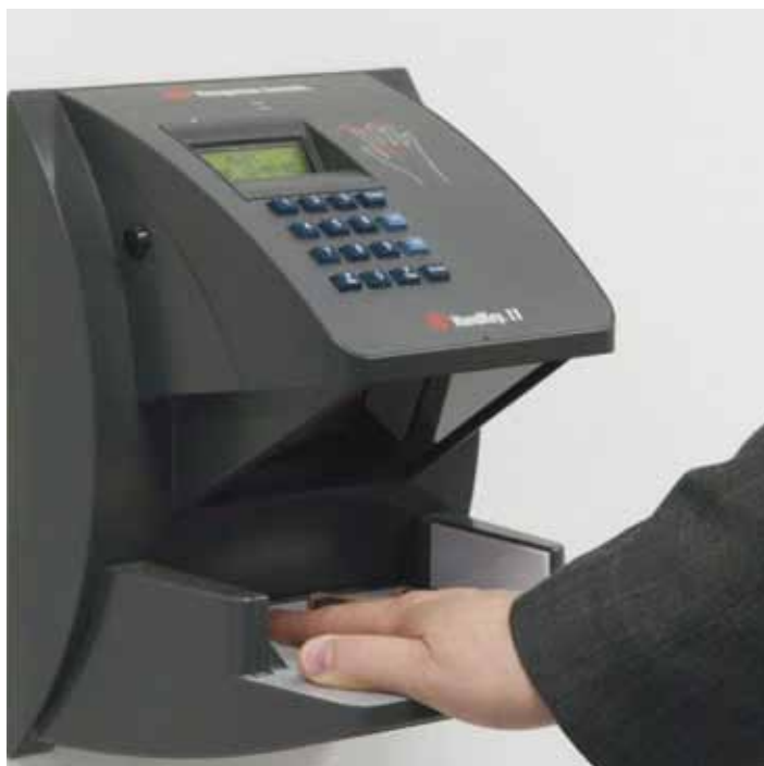
Biometric HandReader by Recognition Systems

"Security is our watchword in this business – we need to offer our data centre customers 100 per cent availability of high speed Internet access, storage, recovery, specialist managed services, and power to keep all data systems up and running."