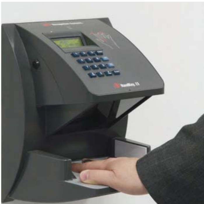
Biometric HandReader by Recognition Systems

"Security is our watchword in this business – we need to offer our data centre customers 100 per cent availability of high speed Internet access, storage, recovery, specialist managed services, and power to keep all data systems up and running."