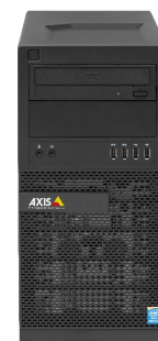
AXIS S9001 Desktop Terminal sold separately