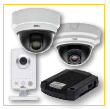
Most Axis network video products are suitable for AVHS system setup.

It is easy to benefit from AXIS Video Hosting System. Based on your specific requirements, we can recommend a qualified Axis Hosting Provider who can guide you in the process of setting up your own Internet-based service portal. They work for you behind the scenes giving you the freedom to focus on your business and customers.