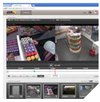
The user interface can be customized to meet your company's profile.